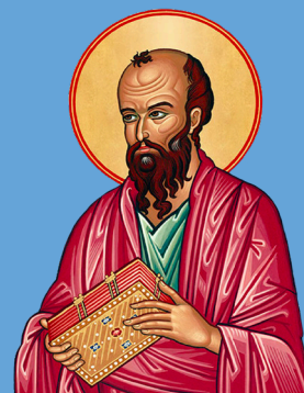
St. Paul the Apostle c. 5 – c. 67 AD

The Apostle Paul wrote to the Galatians about the beautiful qualities that grow in the lives of those who are filled with the Holy Spirit: “The fruit of the Spirit is love, joy, peace, patience, kindness, goodness, faithfulness, gentleness, and self-control” (Galatians 5:22-23).