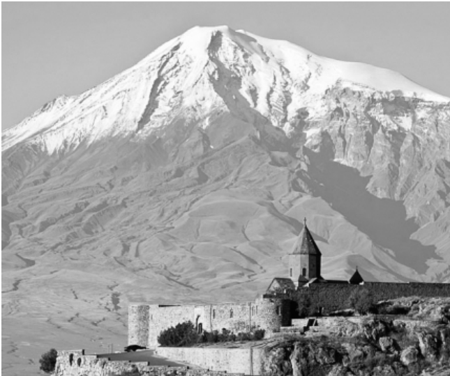
Khor Veerap Monastery - 7th Century, Armenia

✠ Orhnyalk yegherook ee shnorhats soorp Hokvooyrn. Yertayk khaghaghootyamp yev Der yegheetsee unt tsez unt amenesyant. Amen.