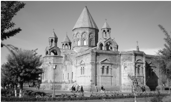
Cathedral of Holy Echmeeyadzeen - 4th Century, Armenia

Lord, we have once again arrived at the end of another week which You gave to us, a week which was filled with good times and bad. We're not always sure how to understand Your ways, but we know that You are guiding us when we open our hearts and minds to you. As this week comes to an end, we ask that You bless each of us in the way that You think we should be blessed, and we ask this as we pray... (Lord's Prayer)