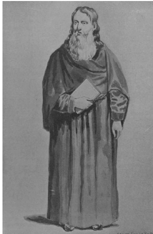
St. Gregory of Narek, 10th Century

Christ our God, You, Who suffered on the cross for our sins, bless this day before us. Grant us the patience and understanding to be good Christians today; to help others, to love others and to smile throughout the day, knowing how much You love us. We ask that You continue to bless us and our camp experience as we pray... (Lord's Prayer)