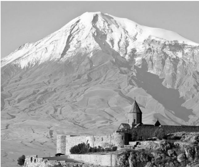
Khor Veerap Monastery - 7th Century, Armenia

✦ Օրհնեալք եղերոք ի շնորհաց Սուրբ Հոգոյն. Երթայք խաղաղութեամբ և Տէր եղիցի ընդ ձեզ ընդ ամենեսեանդ: Ամէն: