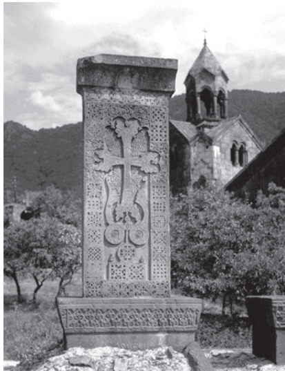
Traditional Armenian Khachkar (Stone-Cross)

✠ May you be blessed by the grace of the Holy Spirit. Depart in peace and may the Lord be with you all. Amen.