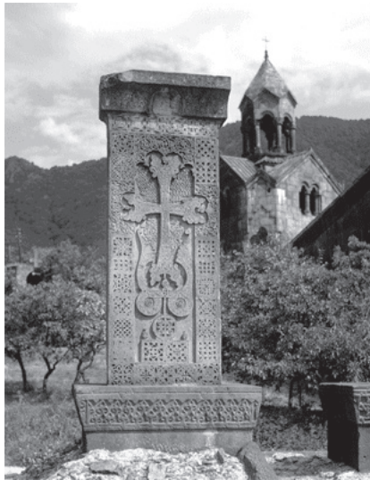
Traditional Armenian Khachkar (Stone-Cross)

✠ May you be blessed by the grace of the Holy Spirit. Depart in peace and may the Lord be with you all. Amen.