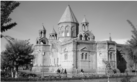
Cathedral of Holy Echmeeyadzeen - 4th Century, Armenia

Lord, we have once again arrived at the end of another week which You gave to us, a week which was filled with good times and bad. We're not always sure how to understand Your ways, but we know that You are guiding us when we open our hearts and minds to you. As this week comes to an end, we ask that You bless each of us in the way that You think we should be blessed, and we ask this as we pray... (Lord's Prayer)